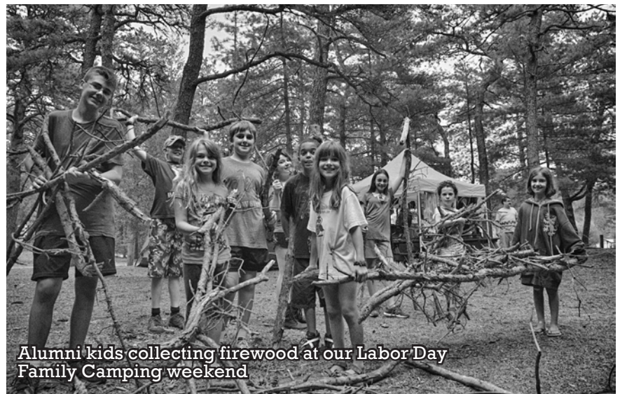
Alumni kids collecting firewood at our Labor Day Family Camping weekend