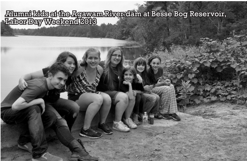
Alumni kids at the Agawam River dam at Besse Bog Reservoir, Labor Day Weekend 2013