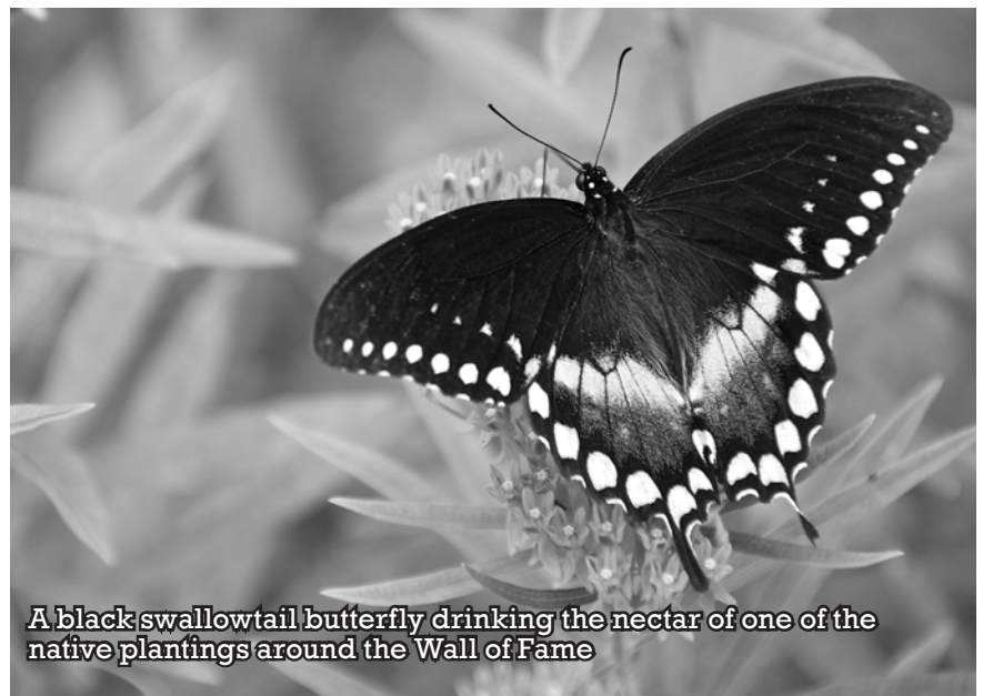
A black swallowtail butterfly drinking the nectar of one of the native plantings around the Wall of Fame