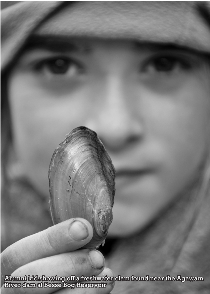
Alumni kid showing off a freshwater clam found near the Agawam River dam at Besse Bog Reservoir

Between Our Memorial Day and Labor Day Family Camping Weekends