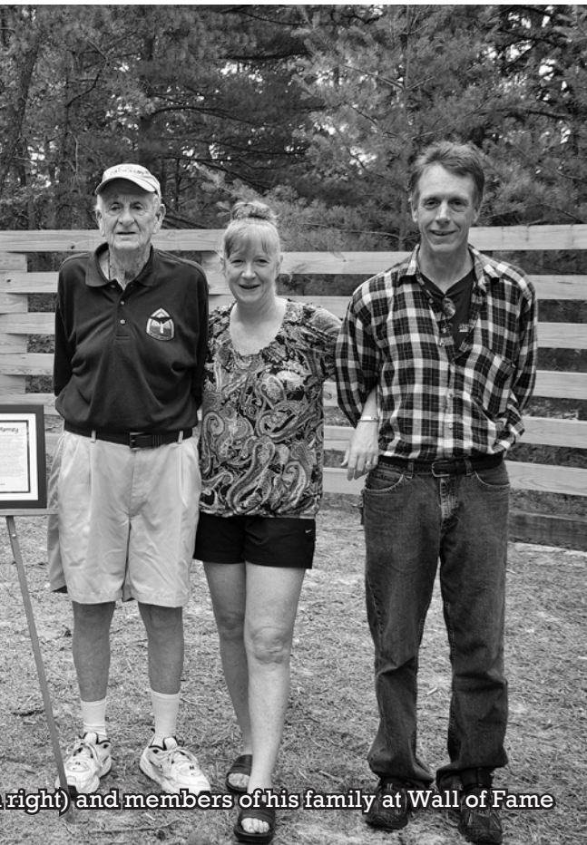
(right) and members of his family at Wall of Fame

and Homecoming 2013, it was a busy summer for the Alumni Association