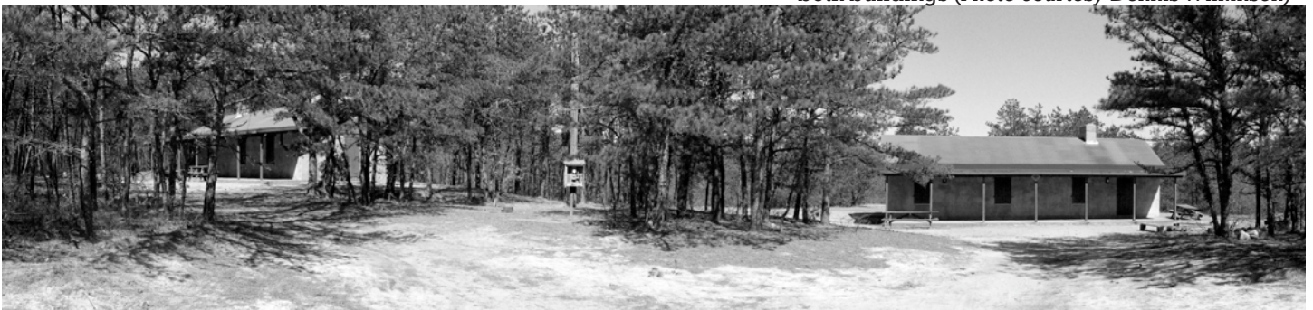
Below: Cabin 1 (left) and Cabin 2 (right), as seen from the road approaching both buildings