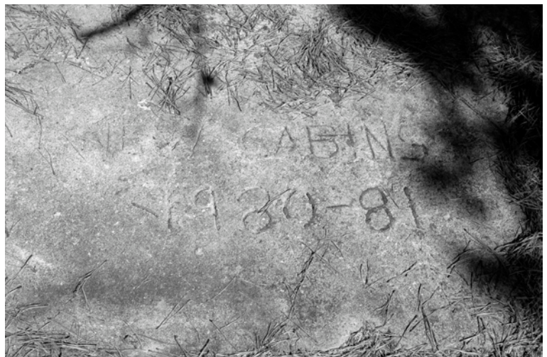
Above: the slab of the of pump shed between the cabins