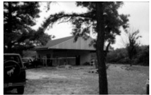
The 1989-2005 Trading Post, construction nearly complete.