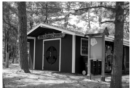
The Silver Fox's Trading Post, just prior to the opening of the 2007 summer camp season..