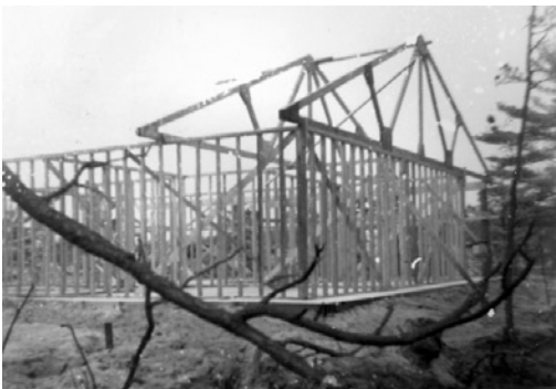
Construction begins on the 1966-1987 Trading Post.