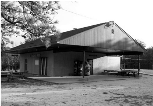
The 1989-2005 Trading Post, after the addition of showers on the back side, just visible on the right of the bulding.