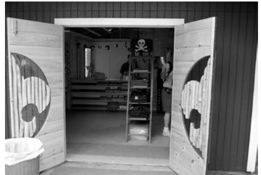
Looking into the Silver Fox's Trading Post.