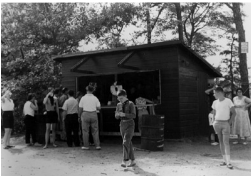
The original Trading Post, seen here in the mid-1950s.

This Trading Post was substantially larger than its predecessor: a main building containing a meeting room/office space; a rest room; a sales area that included both 3 swing-up service windows at the counter and a walk-in area with glass-front display cabinets; a Quartermaster's Store with its own swing-up service window, and a large attic storage space. The building also provided a large swath of covered space along two sides for patrons to shade themselves (or stay out of the rain). During its tenure, this building saw more Scouts than any other Trading Post in Cachalot. It even occasionally served as a program area, its covered space used for several summers as the Handicraft department, operating out of