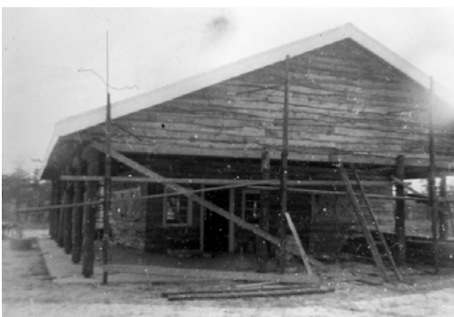
The 1966-1987 Trading Post, nearly complete.