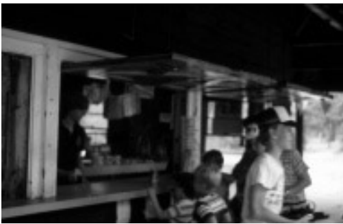
Scouts shopping at the 1966-1987 Trading Post.