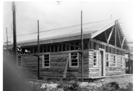
Siding work on the "admin" side of the 1966-1987 Trading Post.