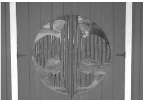
The fleur-de-lis design on the door of the Silver Fox's Trading Post.