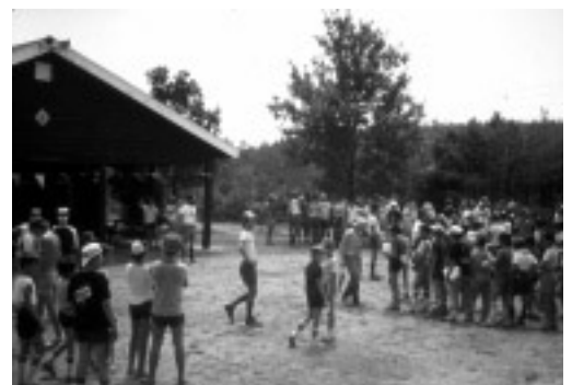
The 1966-1987 Trading Post, seen here as the gathering point after a lost bather drill (LBD) in 1983.