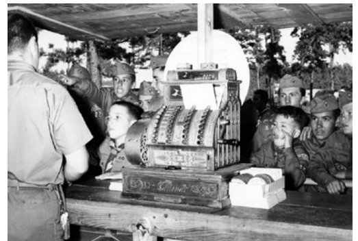
View of Scouts from inside the original Trading Post.