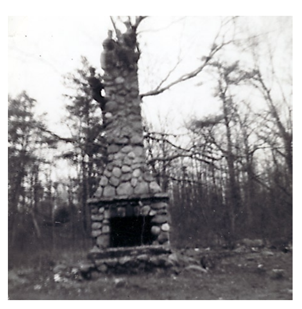
Above: Chimney of Prescott Hall in the early 1950s