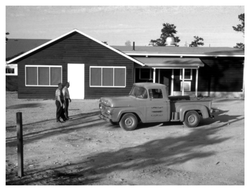
Above: not the Prescott Dining Hall Below right: the plaque that led to the confusion